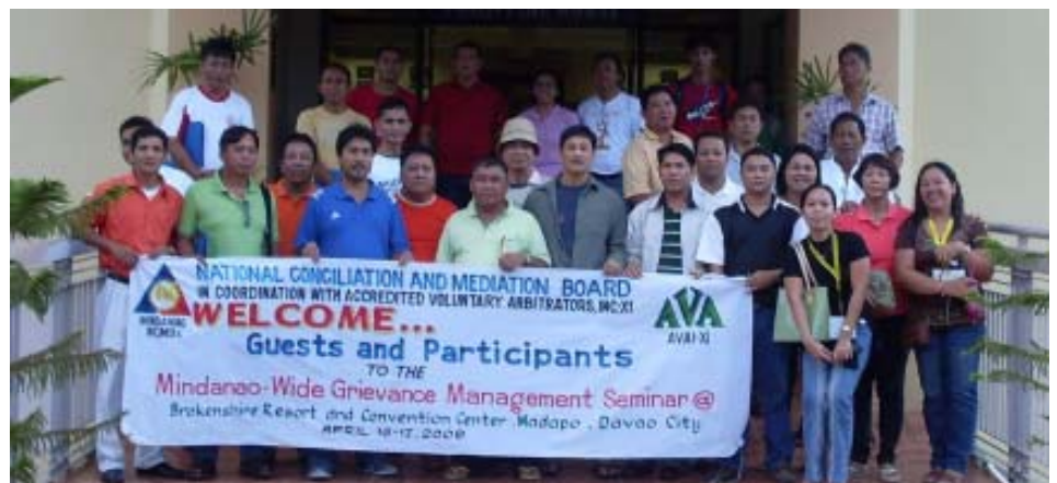
Participants pose for a souvenir photo during the Mindanao-wide Seminar on Grievance Management held at Brokenshire Resort and Convention Center, Madapo, Davao City on April 16-17, 2009. The seminar was organized by the Mindanao Cluster of the NCMB, in coordination with the Accredited Voluntary Arbitrators, Inc. (AVAI-XI). Seventy-six participants from 22 companies in Region XI attended the seminar. (related story on page 2)

The PAVA Board conducted its first quarterly meeting and consultation in Cebu last March 30-31, 2009. The third quarterly meeting will be held in Dagupan City October 17-18, 2009 while the fourth quarter meeting will be in Manila on November 29-30, 2009.